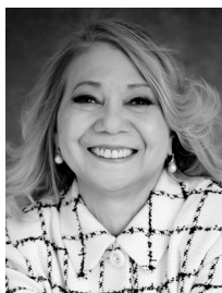
CALIFORNIA STATE UNIVERSITY CHANCELLOR